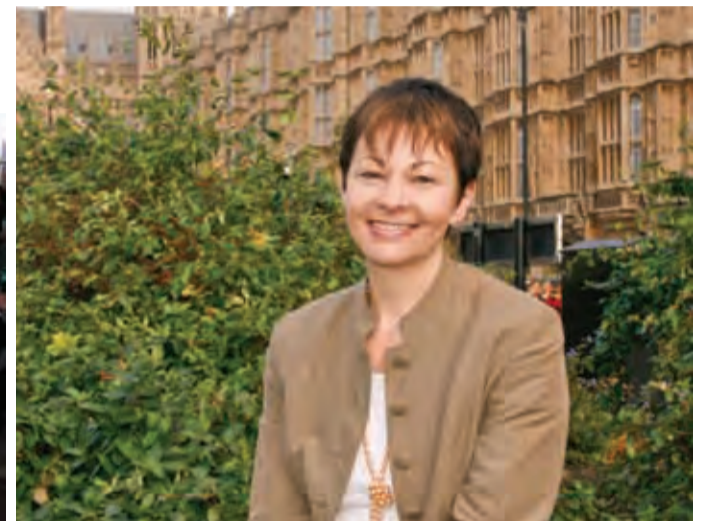
Caroline Lucas outside the Houses of Parliament