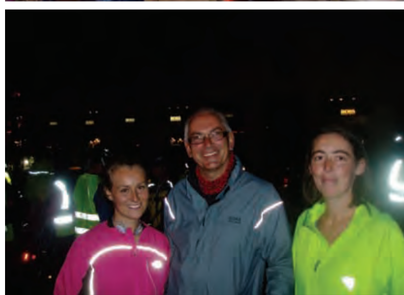
Top: Lewes Road Community Gardens