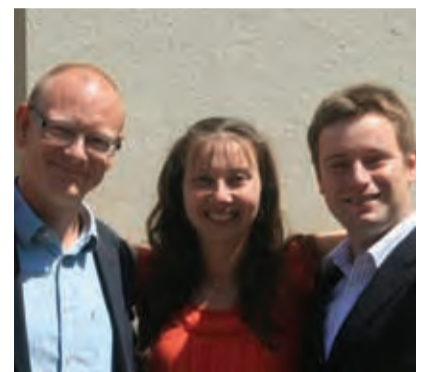
Your Green Queen's Park Councillors

| QUEEN'S PARK'S 'PEPPERPOT' GETS A NEW LEASE OF LIFE