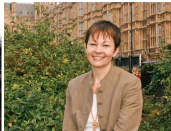
Caroline Lucas outside the Houses of Parliament