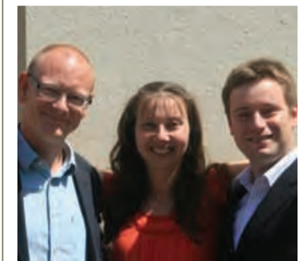
Your Green Queen's Park Councillors

| QUEEN'S PARK'S 'PEPPERPOT' GETS A NEW LEASE OF LIFE